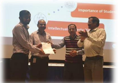
Appreciation of Invited Speakers